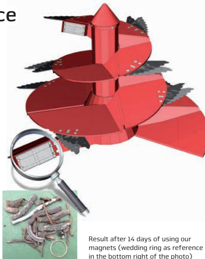
Result after 14 days of using our magnets (wedding ring as reference in the bottom right of the photo)

Each silage and any kind of purchased fodder might contain metallic foreign objects which might harm your dairy cattle. The Strautmann magnetic system (optional) is directly mounted at the mixing auger and very effective due to direct contact with the mixed fodder.