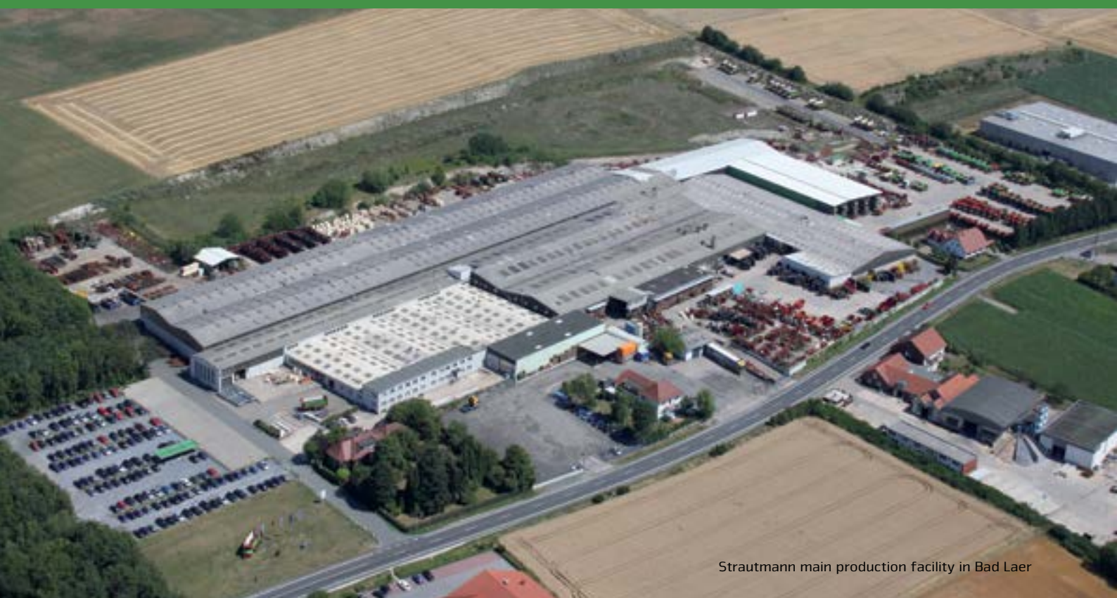
Strautmann main production facility in Bad Laer