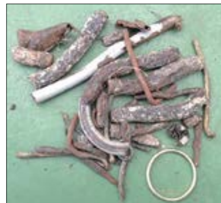
Caption: Metallic trash collected after 14 days of using optional magnets (reference wedding ring in bottom right of photo)

Optional „INNODUR“ wearing elements significantly extend the service life of the Vario 2 mixing auger.