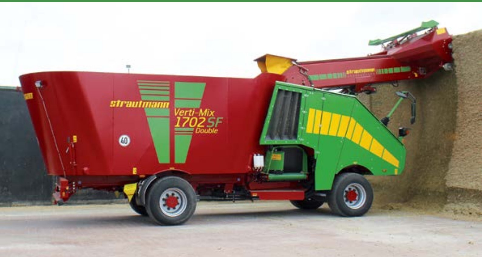
Verti-Mix self-propelled wagon