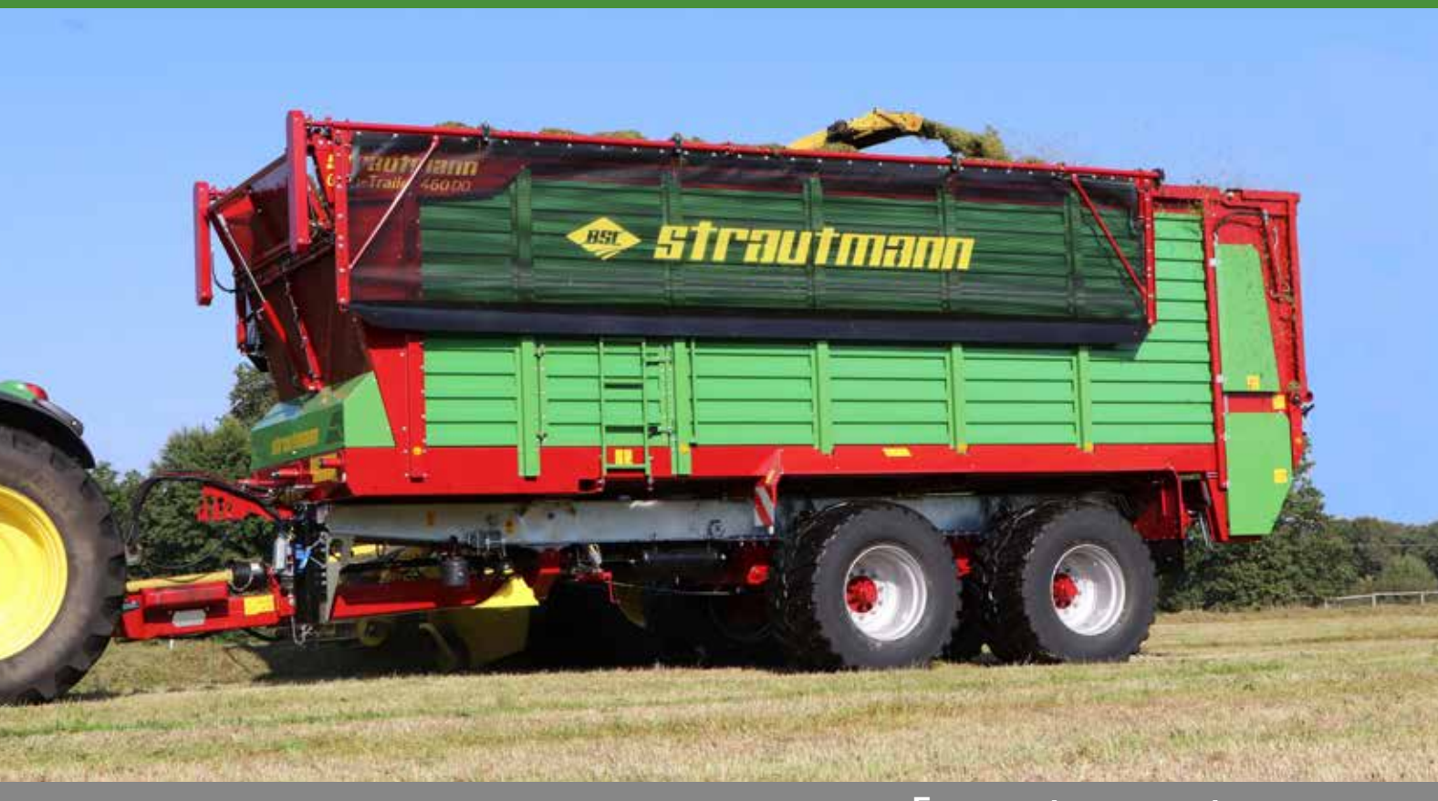
Forage transport wagon