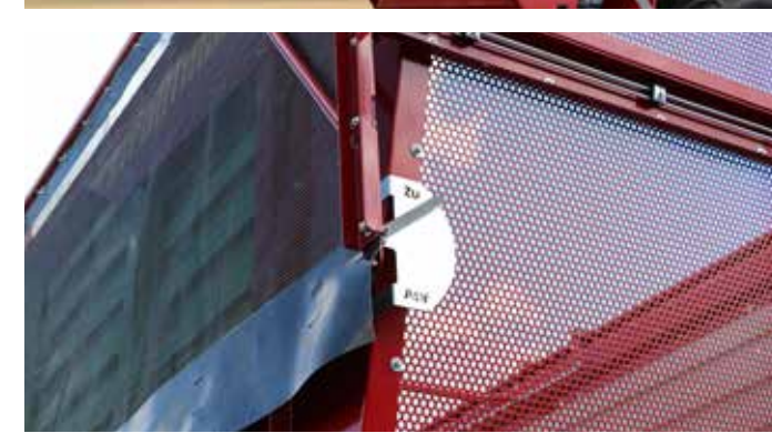
Technical modifications reserved